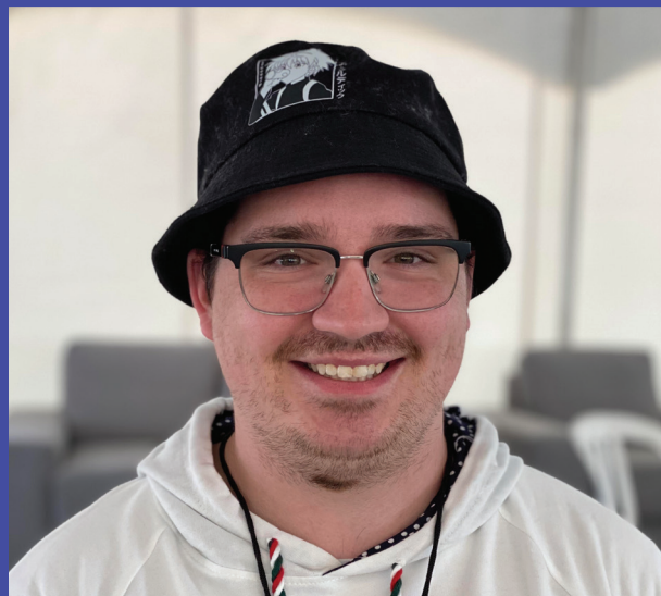
Dakota Outdoor Blues Café